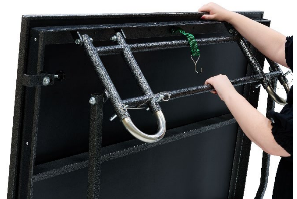
Fig 1.1 Repeat the process on all legs.