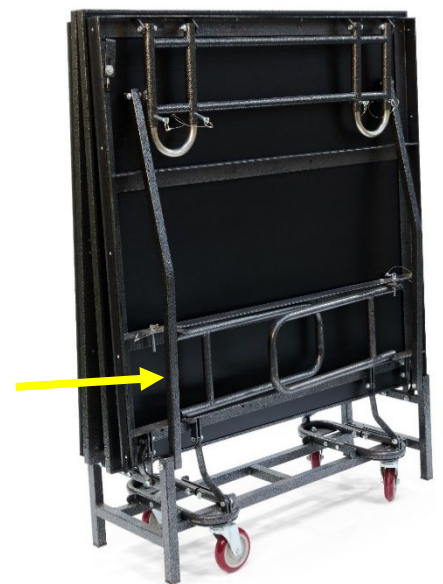
Fig 1.2 – Location of Leg Supports